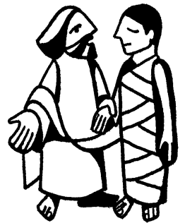
Lazarus, come out

The Gospel passage confronts us with the ultimate mystery of our existence: 'I am the resurrection and the life...do you believe this?' For us as Christians, it is the moment to place all our hopes in Jesus: 'Yes, Lord, I believe that you are the Christ, the Son of God, the one who was to come into this world'. Union with Jesus in this life prepares us to overcome the barrier of death, so that we may live eternally with Him. Faith in the resurrection of the dead and hope in eternal life opens our eyes to the ultimate meaning of life: we have been created for resurrection and life.