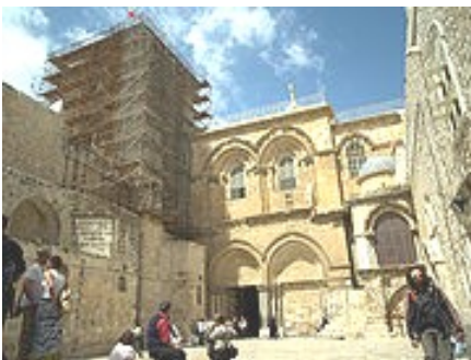
The Church of the Holy Sepulchre

I thought it would be good to give you a brief summary so that you can join us in spirit on a day by day basis. Our first night is in Jerusalem . Sunday morning we will be in Bethlehem and celebrate Mass in the Church of the Nativity . We visit the sight of the Shepherds Fields before we travel north into Jordan and visit Bethany . “ Bethany beyond the Jordan ” where John was baptising. We are now close to the Dead Sea . On Monday we visit the Crusader Castle and continue to Petra , the Rose Red City . Tuesday we spend the day in Petra , visit the Treasury and other monuments. Later we drive north to Amman . On Wednesday we visit Mount Nebo where Moses is said to have viewed the Promised Land . From there we move on to see an ancient map of Jordan which shows significant old and new Testament cities. On Thursday we visit Jerash “ the region of the Jerasenes ” an incredibly preserved Roman city and also the legendary setting of the film “ Lawrence of Arabia ”. From there we move back to Jerusalem . On Friday we enter the city of Jerusalem and join the Way of the Cross follow the Via Dolorosa to the Church of the Holy Sepulchre for morning Mass. We visit the upper room , the sight of the last supper and spend the rest of the day in Jerusalem. On Saturday we return to Tel Aviv for our return flight to Heathrow.